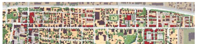
Small Area Plan for Railroad District West of Martin Luther King, Showing Fine-Grained Street Network