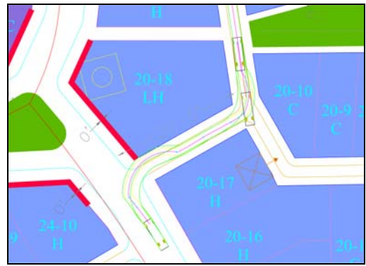
HPE conducted AutoTurn analyses of the plan