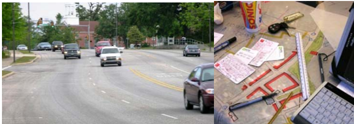
Existing Moss Point Street and Charrette Tools