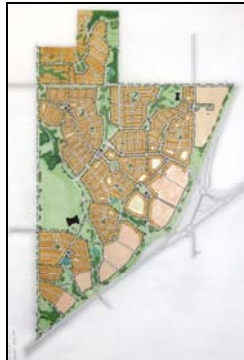
New Town Liberty is a Traditional Neighborhood Design Community

HPE later collaborated with Alternative Street Designs, Inc. on operational analysis of the proposed roundabout program for New Town Liberty.