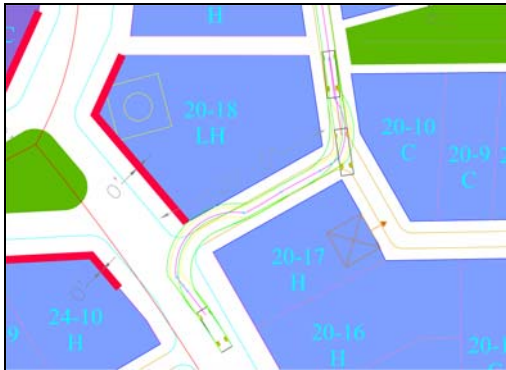
HPE conducted AutoTurn analyses of the plan

Responsibilities included evaluation of thoroughfare design and assignments, with modifications where necessary. Evaluation included preliminary AutoTurn analysis. HPE also created additional street sections to address bicycle transportation issues. HPE traveled to Flagstaff and conducted two workshops with City staff on walkable street design.